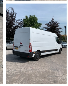
Sold Fully Serviced & Inspected